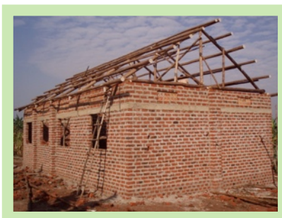
Suubi under construction.

The Suubi Education and Community Centre in Masaka district, Uganda has developed from a concept paper David presented to us during our 2008 trip, to an actual physical structure standing before my eyes when I returned to Uganda with the very first HUG volunteer group in 2009. For less than $16,000 we had been able to fully construct a training hall, office, pit latrine and water tank that is now fully operational and having an ongoing positive impact on the whole community surrounding Suubi. Unbelievable!