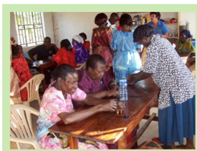
Craft women learning new bracelet weaving skills.

Most of these ladies do not have any other income generating activities, some are the heads of their respective families and others are widows. This opportunity to get them involved means a lot to them as I'm sure you can imagine!