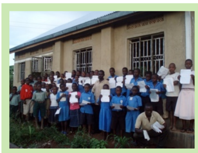
The completed training hall is used by local school children.