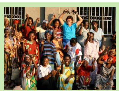
The ladies and I celebrate at their graduation ceremony.