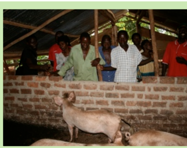
The dam construction at Bujagali are offering free pigs to local families.