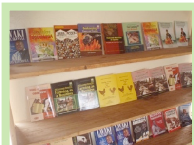
With donations from Australians the number of books are expanding.