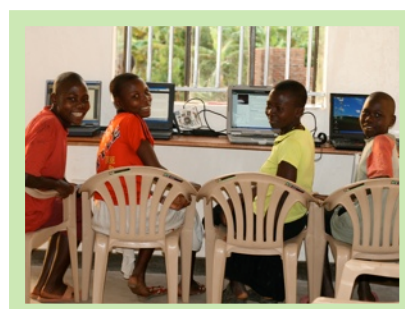
Local teenagers are happy to see computers in the village.