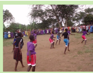
The children enjoyed sports events as well as singing, dancing and drama.