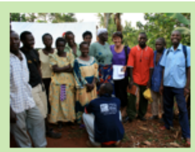
A meeting was held with beneficiaries to try to find a solution.