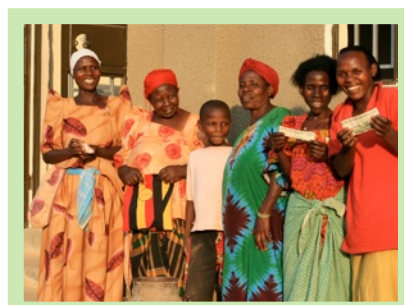
The ladies receive payment for their first lot of bracelets sent to Australia.