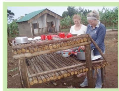
The 1st volunteers to be accommodated in the bandas, enjoy life at Suubi.