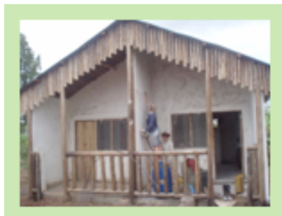
The finishing touches being added in September 2009.