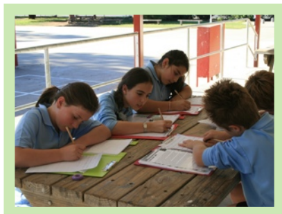
Australian children writing letters to their new Ugandan friends.

Some schools are opting to exchange letters with Ugandan students which gives both the Australian and Ugandan children the opportunity to learn about each other through lasting friendships. Opening the eyes of the next generation to another culture so that we can learn from each other in a mutually rewarding way is indeed at the core of what HUG is all about.