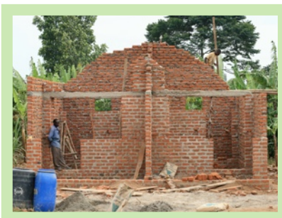
Banda's under construction in July 2009.

In 2009, with support from a grant obtained by HUG from TAQA Canada, the first Banda (accommodation place) at Suubi has been put up. The Bandas are expected to be another source of income for Suubi's sustainability in future. Overseas volunteers will be requested to pay some money for accommodation in these bandas. This money will be used to implement some other work at Suubi such as catering for electricity bills, communication bills, structures and activities extensions, as well as other possible administrative costs. Two more Bandas, as per the plan, still need support for construction. We expect that the local community will benefit from the volunteers coming to Suubi by selling some of their produce and services. Activities such as washing volunteers' clothes and cooking meals will enable them to earn a living. The first lot of 6 (six) volunteers at Suubi in June 2009 that was led by Helen, raised 500,000 Uganda shillings. So you can see that the more overseas volunteers that come to Suubi, the more sustainable Suubi will become.