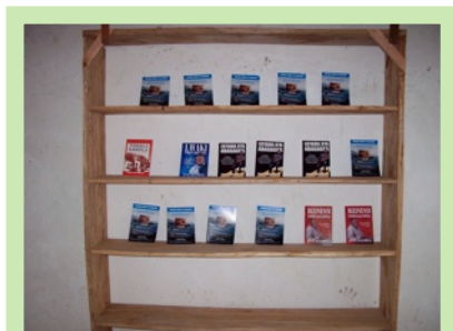
The Suubi Community Library started off slowly.

We are currently working with schools around the area to dramatise the useful development information from these books. Through music, drama and dance we will present it to the public, in an educational and entertaining way. This is an exciting and proven way of passing on new information and ideas, especially for those who can not read and write, but definitely need this information.