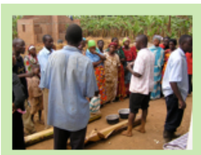
Fuel efficient stove training was attended by many village women.