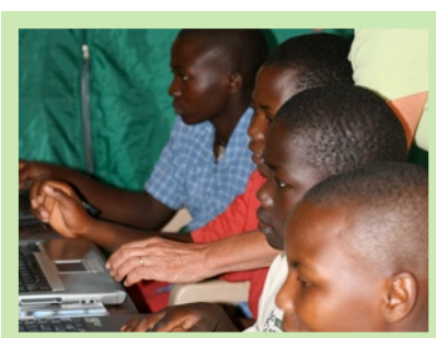
A picture of concentration as they learn new computer skills.