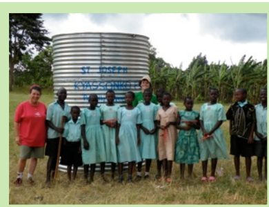
Kyssonko children thanking Bathurst and Lockington communities.