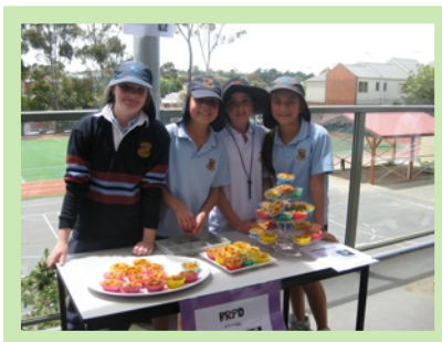
Cake stalls are a popular way to raise money for projects in Uganda