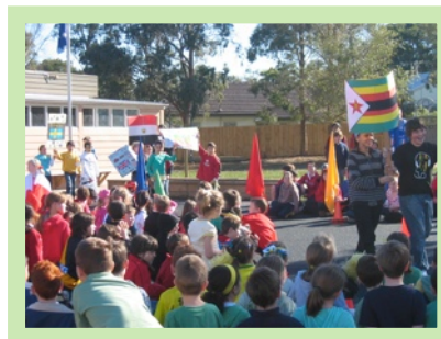
Australian children enjoying sports days to raise funds for a water tank.

On the other hand some Australian schools are choosing to run fundraising events to raise money for particular projects in Ugandan schools. During the last financial year more than $4,200 was allocated from these funds raised, to go towards various partnership schools in Uganda. Installations of water tanks, establishing organic gardens, providing sporting equipment, furniture and livestock for Ugandan schools are just some of the initiatives supported by schools in Australia for their Ugandan counterparts.