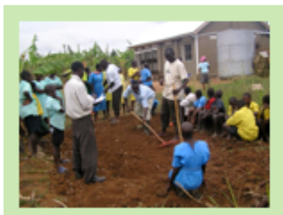
Local school children learn about sustainable agriculture.