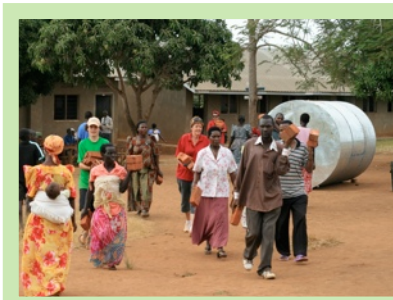
Many parents participated in the installation of the water tank.