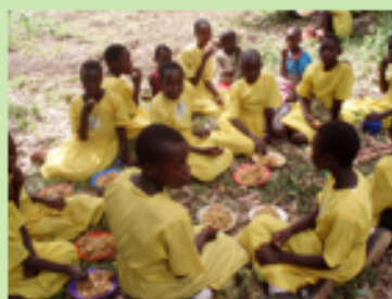
The Harvest Festival saw students sharing a meal from the garden.