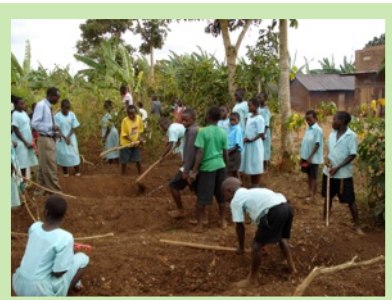
Students put their new garden tools to good use to construct garden beds.